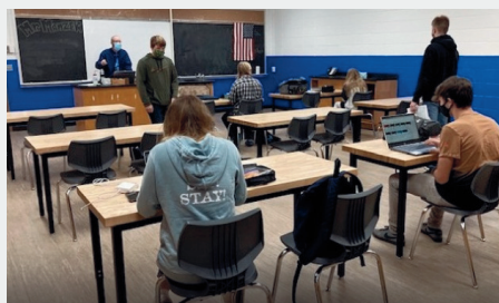
> Updated STEM lab facilities at Mellen School

and replacing lab tables, and the purchase of equipment, supplies, and instructional materials. The total cost will be nearly $70,000, all of which was met through a grant from Enbridge.