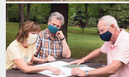
> Recipients of grants gather at Copper Falls State Park.