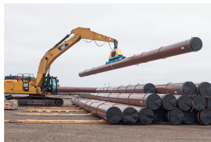
> Initial sections of pipe for the relocation project is being stored at a pipe storage yard near Superior, Wisconsin.

Who would be liable if there were ever a release on Line 5? If there were ever a release on Line 5, Enbridge—and Enbridge alone—would be fully liable. Enbridge carries more than $900 million in insurance coverage, and the company's existing