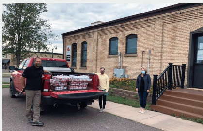
> Enbridge representatives deliver 500 pounds of beef to Brick Ministries.

In September, Enbridge donated a steer it purchased from the Ashland County 4-H Program to Brick Ministries, providing local, grass-fed beef to community members in Ashland, Cable, Cornucopia, and Mellen.