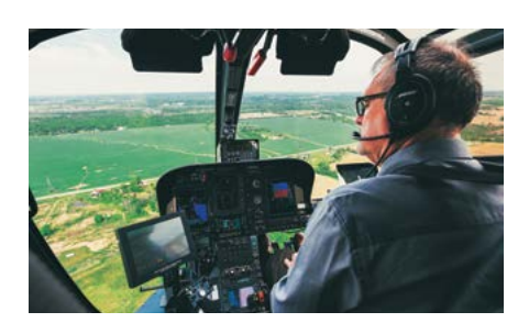
> We conduct regular flyovers on our rights-of-way as part of our ongoing monitoring activities.