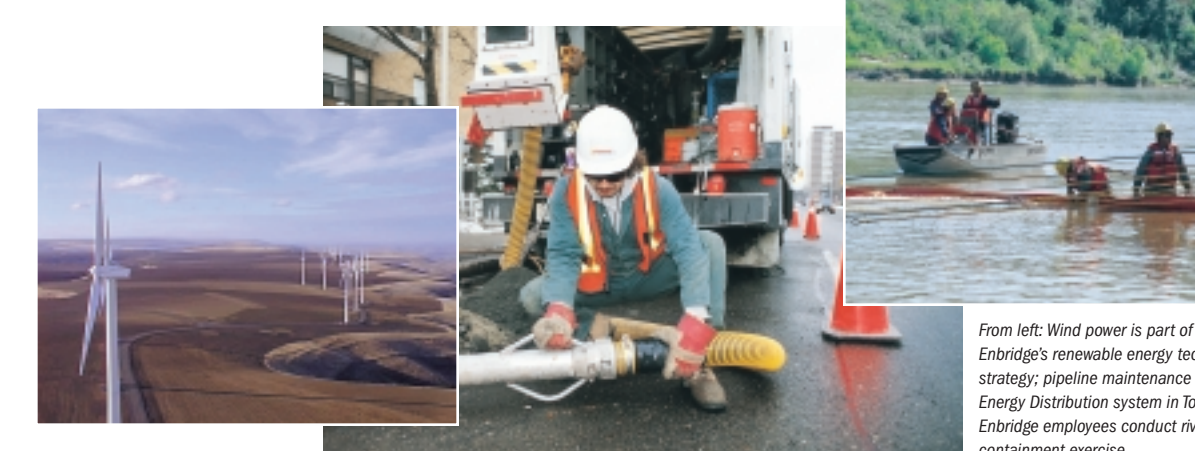
Enbridge's renewable energy technology strategy; pipeline maintenance on the Energy Distribution system in Toronto; Enbridge employees conduct river spill containment exercise.

Enbridge is committed to the protection of the health and safety of our workers and the general public, and to sound environmental stewardship. We believe that the prevention of accidents and injuries and the protection of the environment benefits everyone, and delivers increased value to our shareholders, customers and employees.