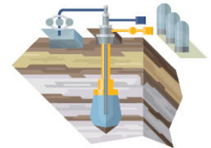
Carbon Capture and Storage (CCS)