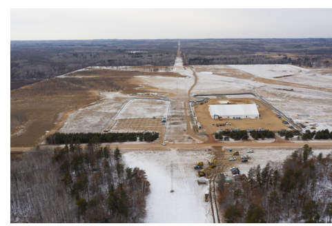
> Pump station facilities like the one under the temporary tent are adjacent to the right of way, which provides the path for the underground pipeline. Near Backus, MN