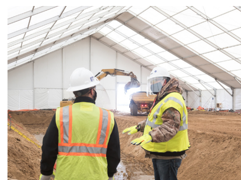
> Eight pump station facilities are also being built to support the replacement pipeline. Temporary tents have been erected to provide for winter construction that includes setting foundation and placing the pumps and piping for the facility. Near Backus, MN