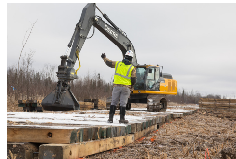
> Wood mats are placed to help protect the ground and provide temporary access roads for heavy equipment. Near Floodwood, MN