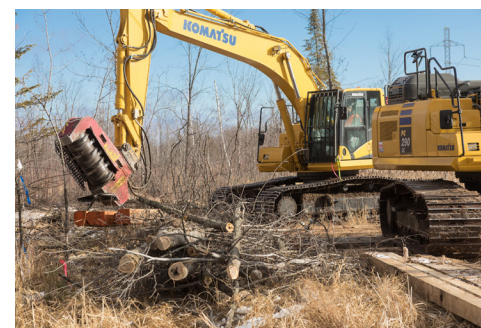
> Pre-construction involves removing brush and trees from the right-of-way. Near Floodwood, MN