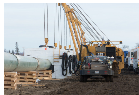
> Little white welding shacks move along the temporarily elevated pipe to each connected joint and shelters the specialized equipment that welders use to join the pipe sections together. Near Gonvik, MN