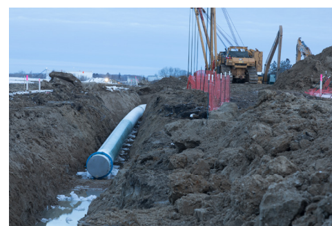
> Some locations are already seeing pipe placed in trenches where the pipeline will soon have three to five feet of soil coverage. Near Clearbrook, MN