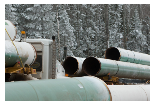
> Trucks haul in sections of pipe to be prepped for welding sections together. On Fond du lac Reservation.