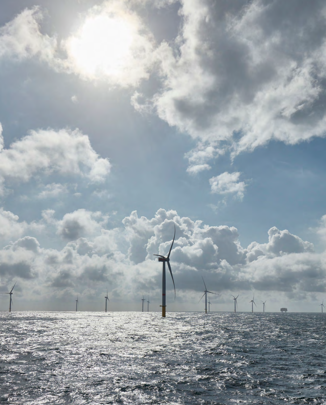
> The 497-MW Hohe See offshore wind project, in the North Sea off the coast of Emden, Germany.

Enbridge has committed to the energy evolution by extending and modernizing our systems, growing our renewable power business, advancing clean energy projects like hydrogen and renewable natural gas, and investing in new technologies.