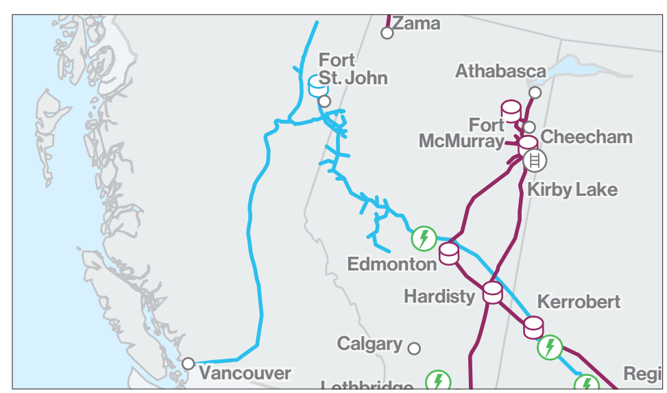
For more detailed information on Enbridge's infrastructure, projects and/or community investment activity in British Columbia, please visit our online interactive map at Enbridge.com/map