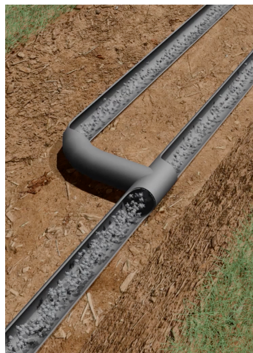
> A visual representation of a pipeline looping.

Click here to watch pipeline looping explained, or go to enbridge.com/BC .