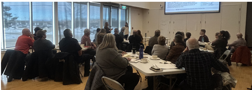
➤ Sunrise Expansion Program roundtable discussion in Mackenzie on Feb 11, 2025.