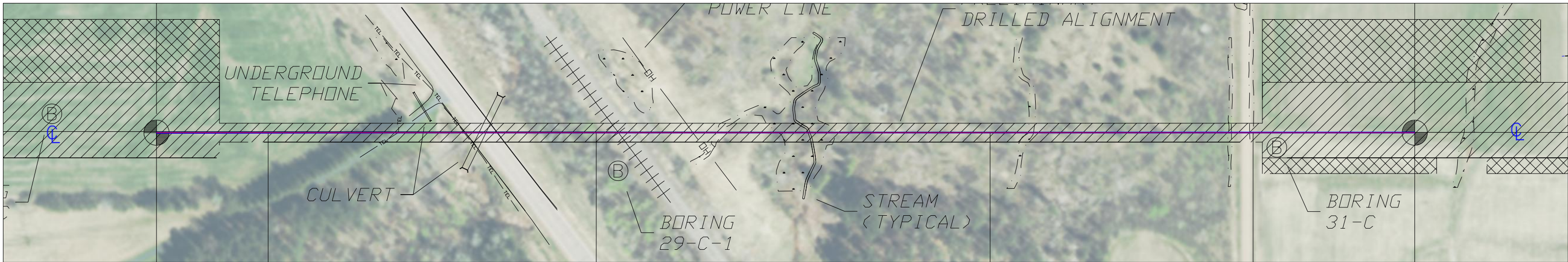
OVERALL PLAN VIEW