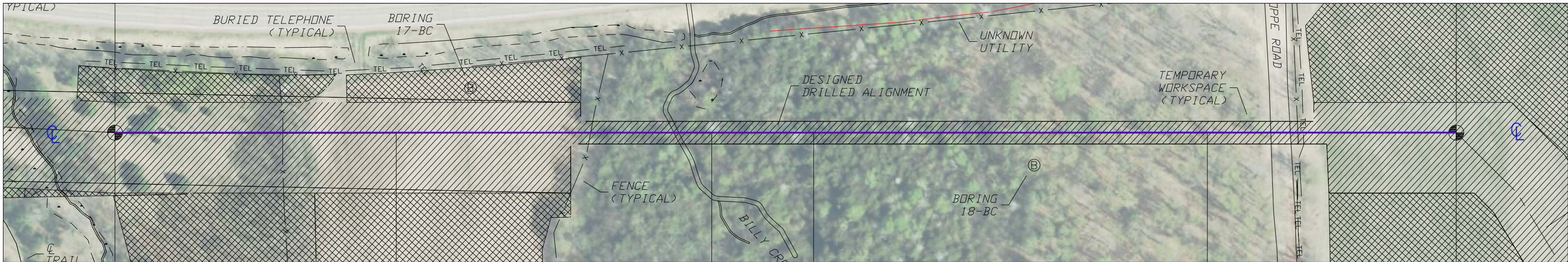
OVERALL PLAN VIEW