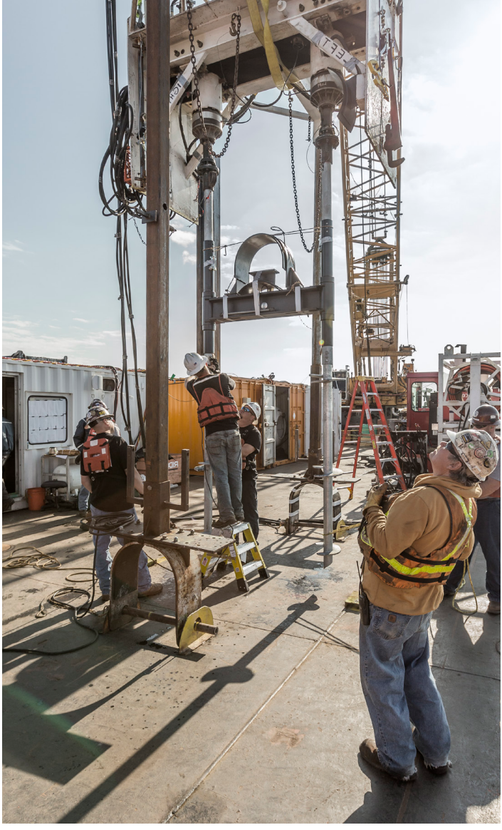
> An anchor-screw is prepared for installation on Line 5

That's why we've developed a suite of protective measures to help keep the Straits safe. Our robust operations and maintenance program is just one of those measures.