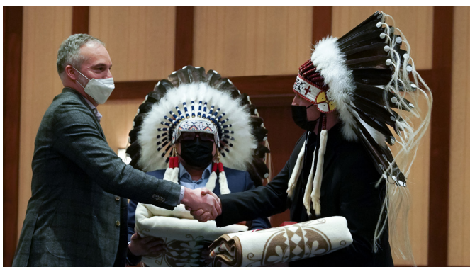
> In February 2022, Enbridge and First Nation Capital Investment Partnership (FNCIP) announced plans to work together to advance a new carbon transportation and storage solution west of Edmonton called the Open Access Wabamun Carbon Hub. The proposed Wabamun Hub will tie into planned carbon capture projects, with the combined potential to abate nearly 4 million tonnes of CO 2 emissions annually.

We also advanced our export strategy with the acquisition of the Ingleside Energy Center, through which we established a leading light-oil export position and platform for future organic growth. We aligned that investment with our target to reach net-zero emissions by 2050 by committing to develop an on-site solar farm that will drive net-zero Scope 1 and 2 emissions, while also contributing to Scope 3 reductions. This is a great example of how Enbridge is differentiating its approach to energy infrastructure.