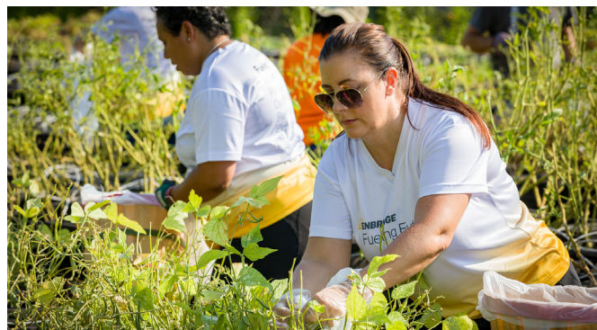
> The Enbridge team continued to make a positive impact in our communities – including a US$4 million contribution to the United Way – and thousands of hours of volunteering with close to 3,000 local community and Indigenous organizations. Our people stepped up to support recovery efforts following wildfires and flooding in B.C., and the same care was shown after Hurricane Ida in Louisiana.

Over the last several years we've worked with our customers to develop a new contract offering for our Canadian Mainline. Last year, our proposal was declined by the Canada Energy Regulator (CER), despite having support from more than 75% of our shippers. We'll continue to collaborate with our customers on two alternative options to assure a solid, long-term commercial arrangement is in place.