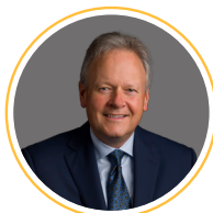
Stephen S. Poloz