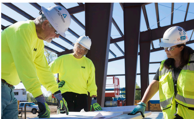
> Indigenous-owned MB Customs worked on the Line 3 Replacement Program in Minnesota.

Engagement with Indigenous groups along the Line 3 right-of-way led to a better route, as well as tailored environmental measures to protect the land and minimize impacts. This engagement also resulted in $900 million in Indigenous business opportunities, including Indigenous workers comprising 7% of the U.S. Line 3 workforce. This valuable experience is being shared across our organization to further strengthen our lifecycle approach to Indigenous and stakeholder engagement.