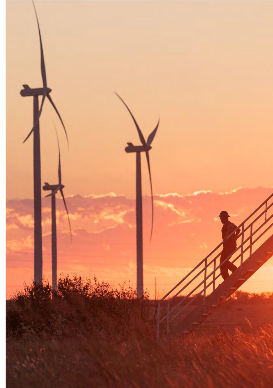
Keechi Wind Project, Jack County, TX

We plan to annually review the alignment of our climate strategy against the climate-related policy development of our associations, including an internal assessment of the Global Standard on Responsible Climate Lobbying. We will provide a progress update on our trade association alignment in our next sustainability report, followed by a comprehensive update in 2025.