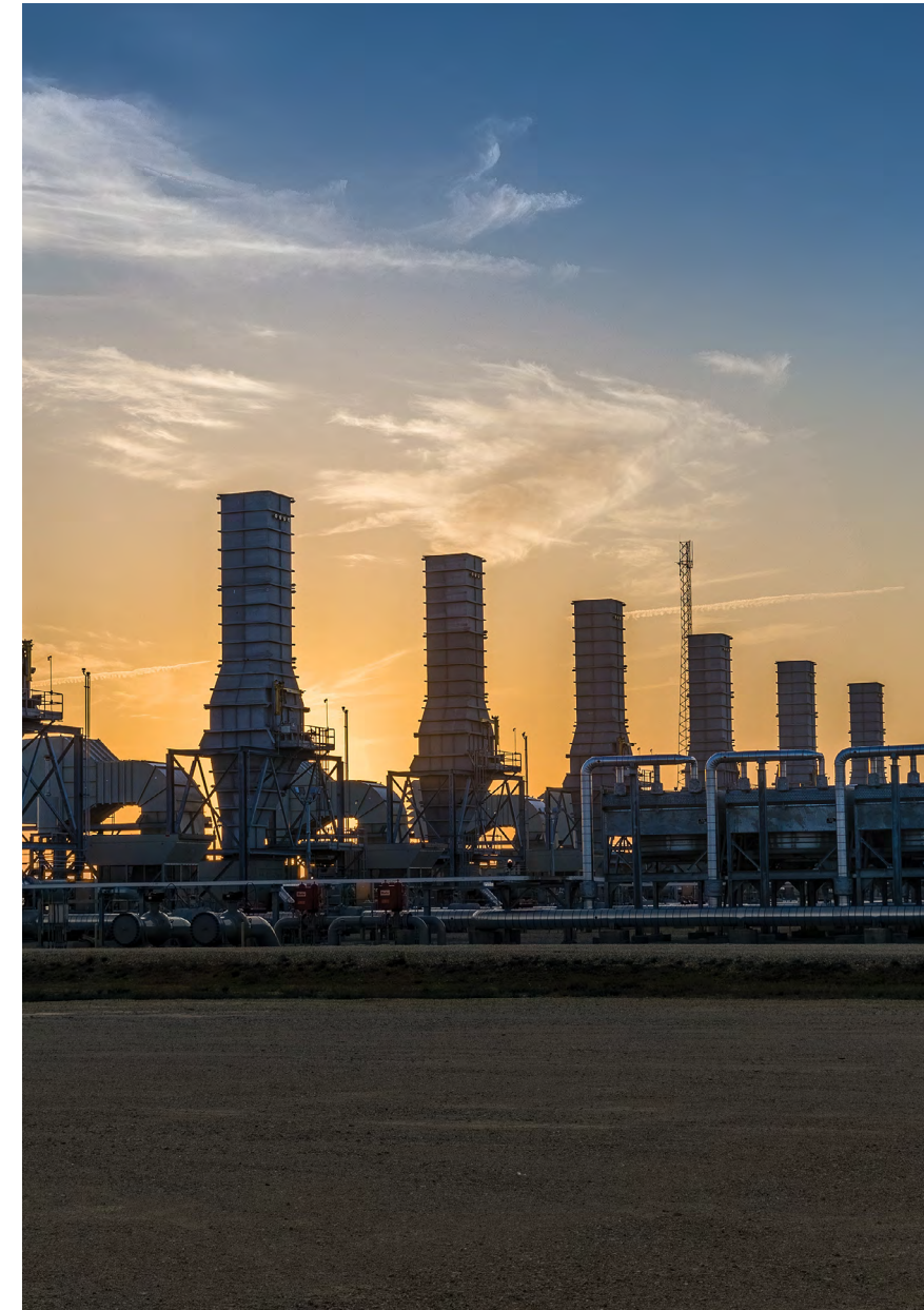
Agua Dulce Compressor Station, Nueces County, TX