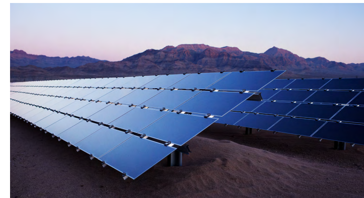
Cover: Enbridge has a 51% ownership in the Silver State North Solar Project, a 52-megawatt solar farm located in Clark County, NV. The project was the first large-scale solar energy project on U.S. public lands in Nevada.

Our assessment of climate-related positions of eight trade associations yielded seven fully aligned and one partially aligned.