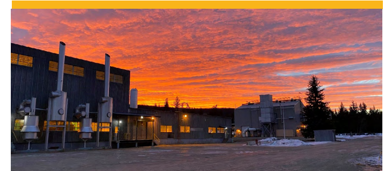
Compressor Station 5, near Quesnel, BC

2021 Vision Forward: Addressing Climate Change Together